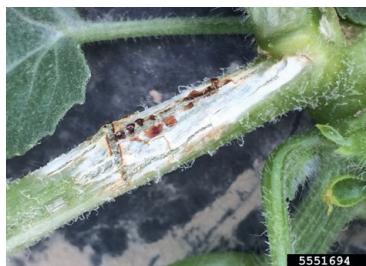
Figure 2. Gummy exudate on a stem canker.

The name gummy stem blight comes from the amber to reddish-brown exudate (ooze) that forms on the stem cankers (lesions) (Figure 2). Stem infections do not normally kill older plants, but affected vines can wilt in the late disease stages, three to four weeks after infection, usually after fruit set. 1,4