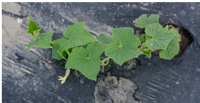
Figure 2. A cucumber plant emerging from a hole in the black-plastic mulch on a raised-bed.

In plasticulture systems, cucumbers are often planted with one or two rows per bed. In two row systems, a 10 to 18-inch plant spacing is recommended for 48 to 72-inch beds, with one (or sometimes two) plants per hole (Figure 2). 9